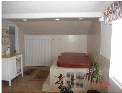
Spacious Loft with Hot tub and bath with ceramic shower And shower enclosure.